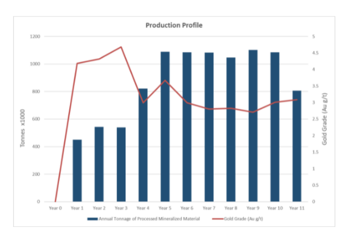
Figure 1-1: The production profile of tonnes versus mined grade